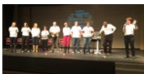
The High School Showcase organizing team

The AVRSB High School Showcase took place on November 10, bringing together all staff involved in supporting high school students for a day of professional learning around the theme of "Communication, Critical Thinking, Collaboration and Creativity." Thank you